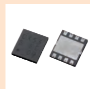
CMOS chopper regulator