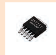
Low power-loss voltage regulator

For insulation of and transfer between high- and low-voltage sides of power supply